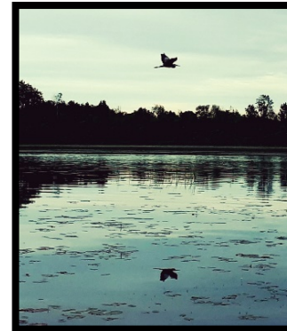
Rideau Wildlife – Rideau Roundtable

The Rideau Migratory Bird Sanctuary was designated by the Canadian Wildlife Service, in 1957, to provide a feeding and resting area for migrating birds. In 1994, a federal Act formalized an agreement between Canada and the US to protect and conserve migratory birds and their nests. The open wetlands of the Sanctuary feature a diversity of aquatic and riparian vegetation, providing a rich habitat for resident reptiles, amphibians, mammals and fish. QR codes lead to photos of flora and fauna of the area, as provided by Friends of the Rideau and Rideau Roundtable.