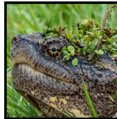
Fauna of the Rideau – Friends of the Rideau

Please do not disturb animals or their homes, remove vegetation, or leave any traces of your visit. The QR code leads to the Invading Species Awareness Program Facebook page, which urges boaters to Clean, Drain and Dry their craft before travelling to other water bodies.